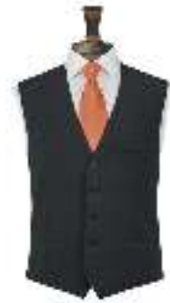
Slim Fit Black with Orange Tie