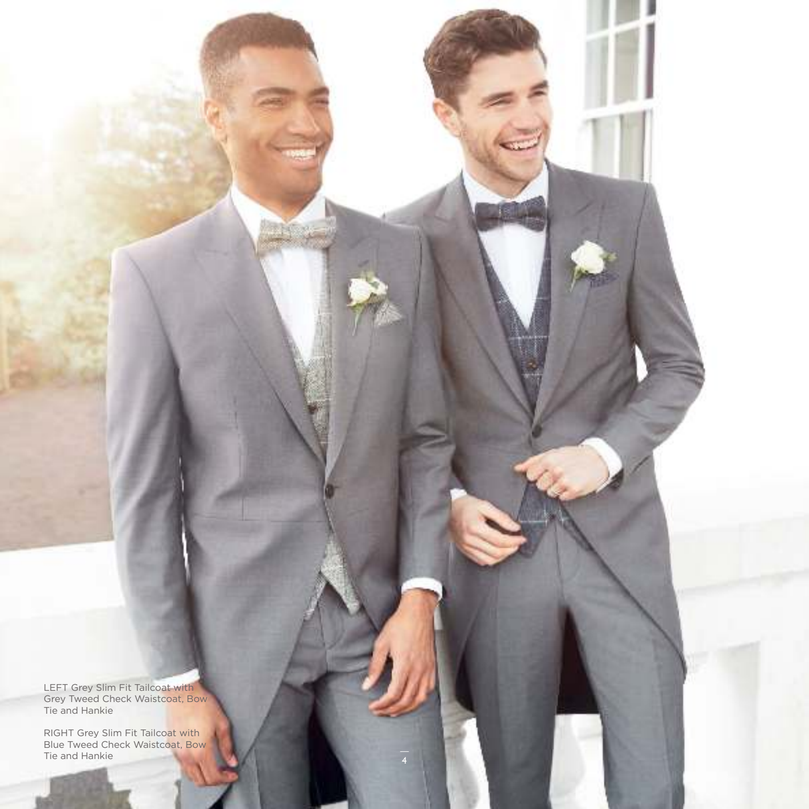
LEFT Grey Slim Fit Tailcoat with Grey Tweed Check Waistcoat, Bow Tie and Hankie