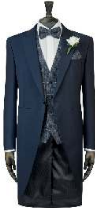
Blue Slim Fit Tailcoat Available in sizes 20S to 60XL