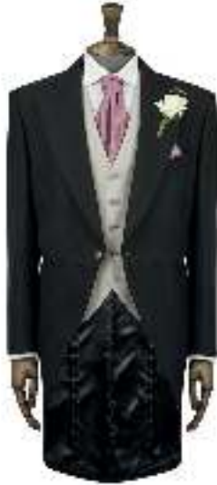
Black Herringbone Tailcoat Available in sizes 20XS to 60XL

Always in style – Black is a classic and sophisticated choice, no matter what the occasion.