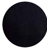
Black Herringbone 18"-54" Waist