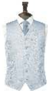
Blue Swirl with Powder Blue Tie