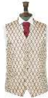
Burgundy Diamond with Burgundy Ruche