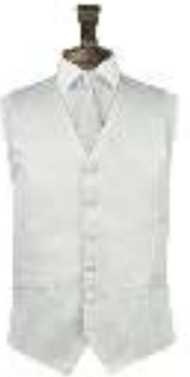
Silver Dash with Platinum Tie