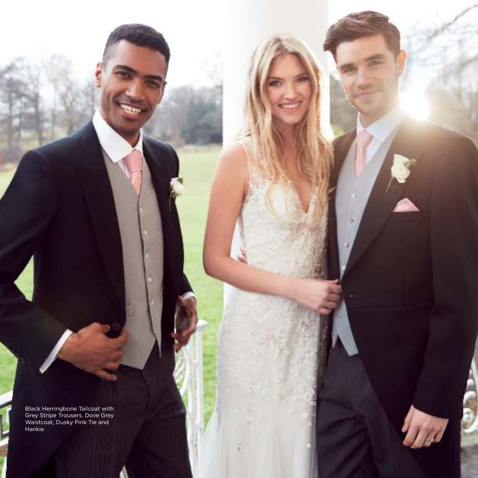
Black Herringbone Tailcoat with Grey Stripe Trousers, Dove Grey Waistcoat, Dusky Pink Tie and Hankie