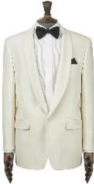
White Tuxedo Available in sizes 34XS to 60XL