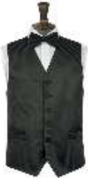
Black Stripe with Black Bow Tie