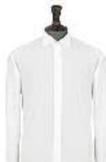
Victorian Collar Slim Fit 9½"-21" Collar