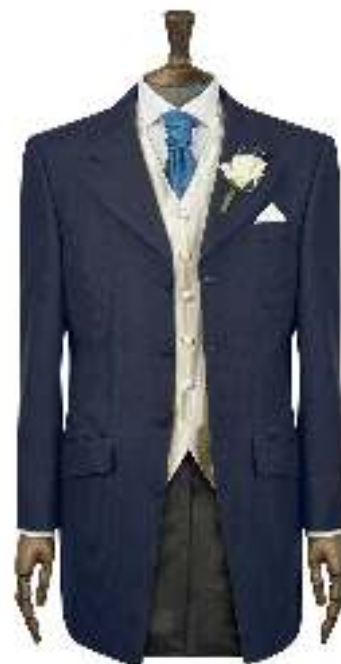
Navy Herringbone Prince Edward Available in sizes 20XS to 54XL