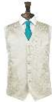
Ivory Leaf with Turquoise Tie