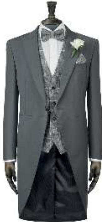
Grey Slim Fit Tailcoat Available in sizes 20S to 60XL

Tweed is a classic fabric that always impresses. Our range of Tweed waistcoats and matching neckwear and hankies will give your outfit that stylish touch.