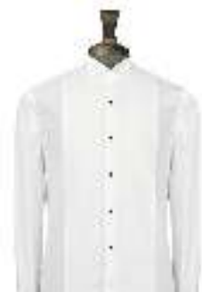
Marcella 14"-21" Collar