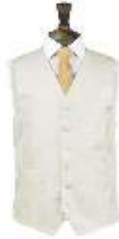
Champagne Scroll with Champagne Tie