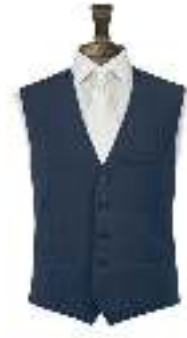
Slim Fit Blue with Ivory Tie