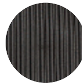
Black Stripe 18"-54" Waist