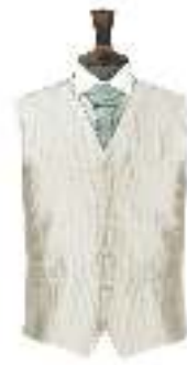
Ivory Stripe with Sage Ruche