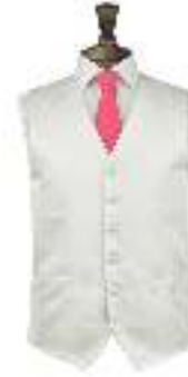
Ivory Dash with Raspberry Tie