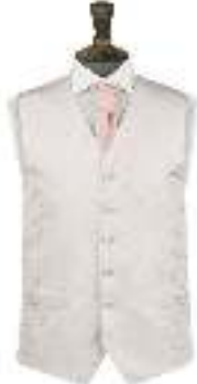
Pink Scroll with Pink Ruche