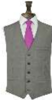
Slim Fit Grey with Magenta Tie