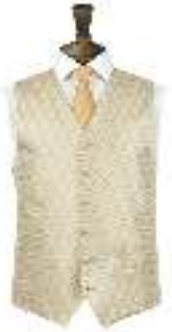
Gold Diamond with Champagne Tie