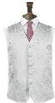
Silver Leaf with Lavender Tie