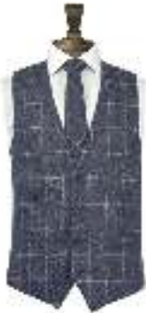
Blue Tweed Check with Blue Tweed Check

The waistcoat elevates any formal look to another level, transforming a standard suit to something special. It denotes occasion dressing in a way no other piece can do. Select from our range of plain, patterned and coloured options to complement your choice of neckwear.