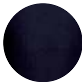
Navy Herringbone 18"-54" Waist