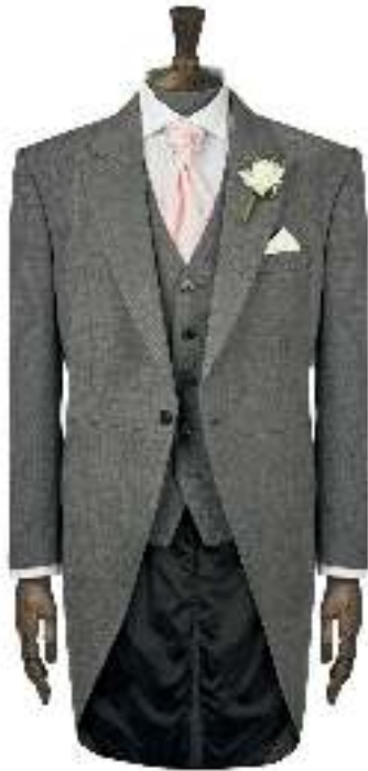
Mid Grey Tailcoat Available in sizes 20XS to 60XL