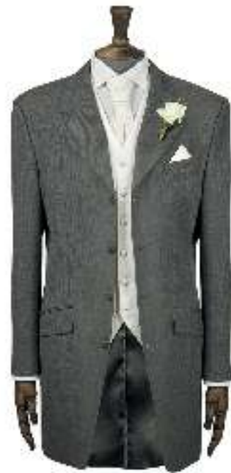
Mid Grey Prince Edward Available in sizes 20XS to 60XL