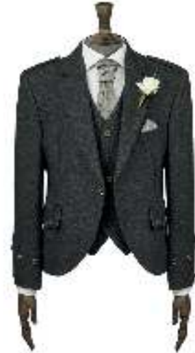
Grey Argyll Available in sizes 20XS to 54XL

Choose your tartan. Kilts available 20" - 50" waist