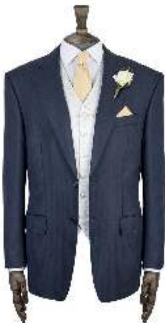
Navy Herringbone Short Available in sizes 34XS to 54L