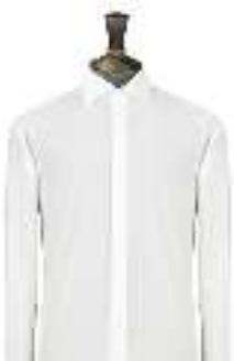
Standard Collar Slim Fit 9½"-21" Collar