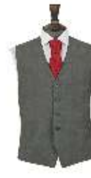
Premium Grey with Claret Ruche