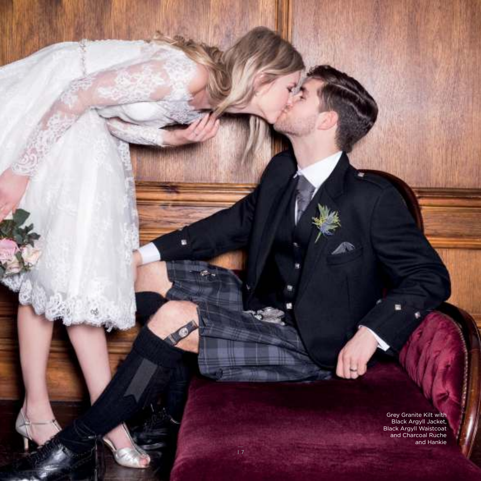
Grey Granite Kilt with Black Argyll Jacket, Black Argyll Waistcoat and Charcoal Ruche and Hankie