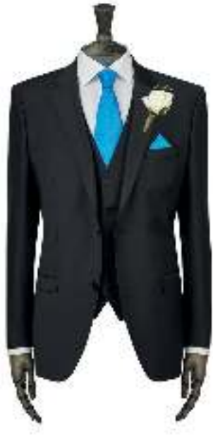
Black Slim Fit Short Available in sizes 34XS to 60XL