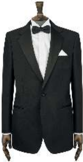
Black Dinner Jacket Available in sizes 20XS to 60XL

When choosing this elegant look, you're making a true style statement.