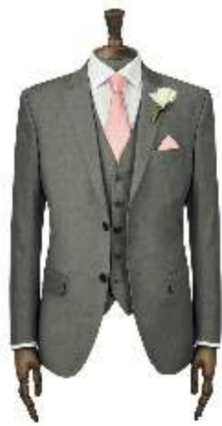
Grey Slim Fit Short Available in sizes 20S to 60XL

Gentlemen, you'd never buy a car without taking it for a test drive first, right? Same rules apply here: don't hire a suit without trying it on first. At Burton, we've made it incredibly easy for you to do just that. Visit burton.co.uk/formalhire to begin your Try On journey.