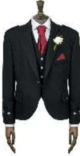
Black Argyll Available in sizes 20XS to 54XL