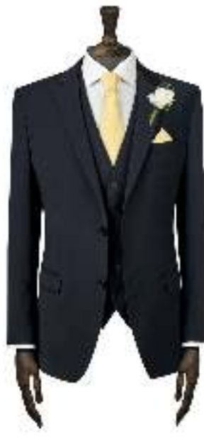
Blue Slim Fit Short Available in sizes 20S to 60XL