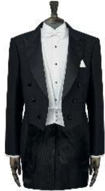
Evening Tailcoat Available in sizes 34XS to 60XL