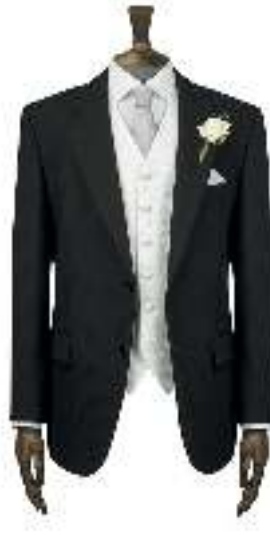
Black Herringbone Short Available in sizes 34XS to 60XL