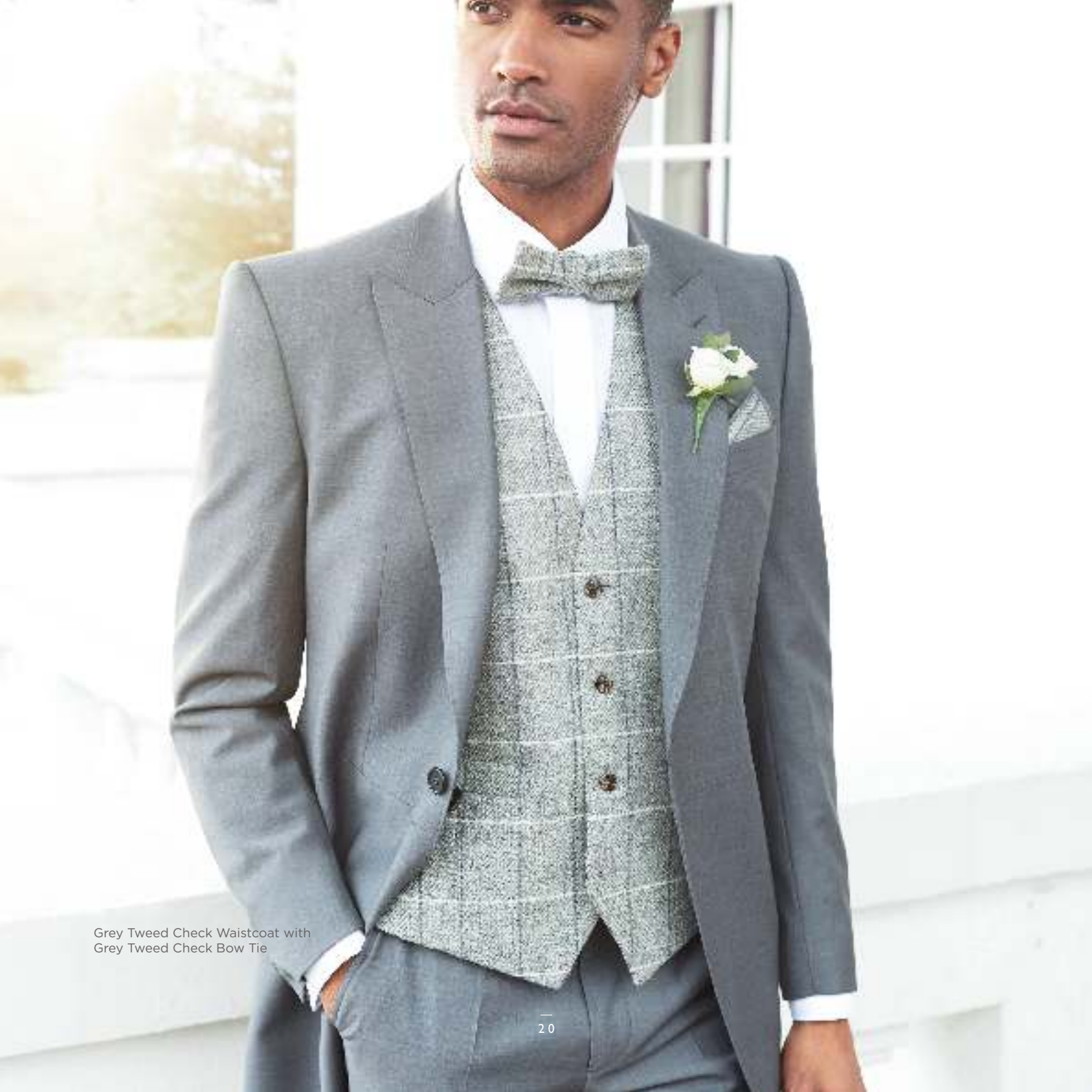
Grey Tweed Check Waistcoat with Grey Tweed Check Bow Tie