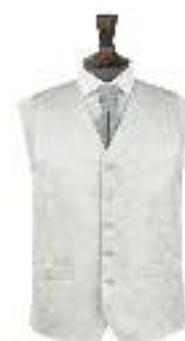
Silver Dash Patterned with Silver Ruche

Gentlemen, you'd never buy a car without taking it for a test drive first, right? Same rules apply here: don't hire a suit without trying it on first. At Burton, we've made it incredibly easy for you to do just that. Visit burton.co.uk/formalhire to begin your Try On journey.