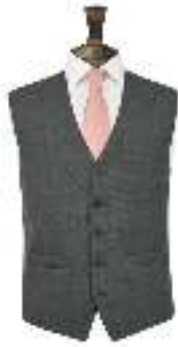
Mid Grey with Dusky Pink Tie