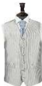
Silver Stripe with Sky Blue Ruche