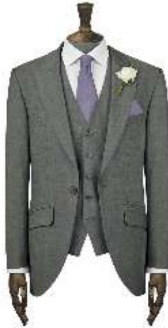
Premium Grey Short Available in sizes 34XS to 54XL

The Premium Collection's sharp tailoring is all you need to make a great first impression.