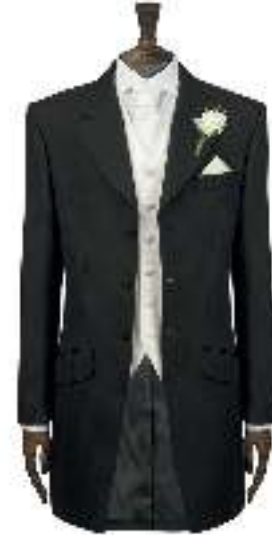
Black Herringbone Prince Edward Available in sizes 20XS to 60XL