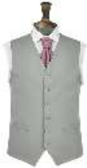
Dove Grey with Lavender Ruche