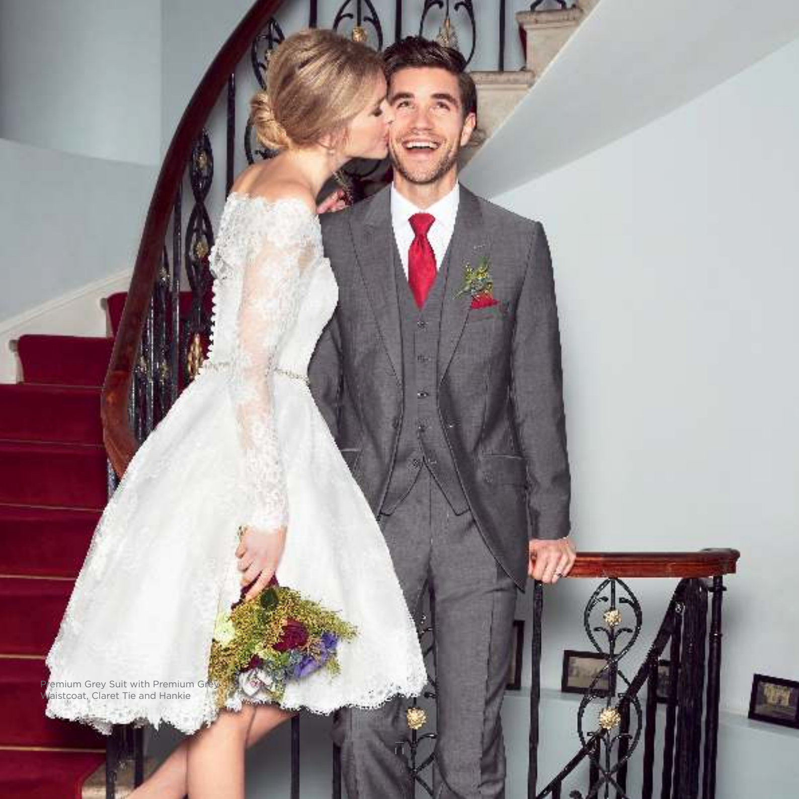
Premium Grey Suit with Premium Grey Waistcoat, Claret Tie and Hankie