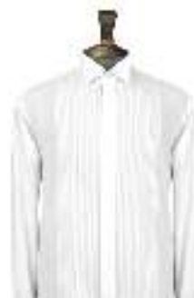
Dress Wing Collar Standard Fit 14"-21" Collar