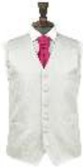
Ivory Dash Patterned with Fuchsia Ruche