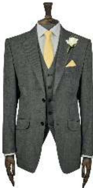
Mid Grey Short Available in sizes 34XS to 60XL