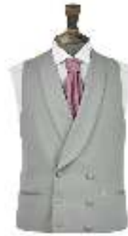
Dove Grey Double Breasted with Lavender Ruche