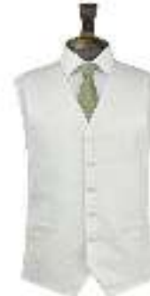
White Scroll with Olive Tie