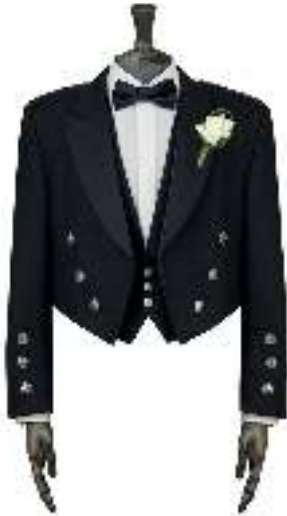
Black Prince Charlie Available in sizes 20XS to 54XL