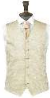
Gold Swirl with Coffee Ruche