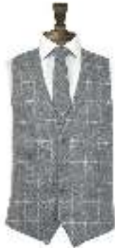
Grey Tweed Check with Grey Tweed Check Tie