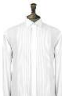
Dress Plain Collar Standard Fit 14"-21" Collar