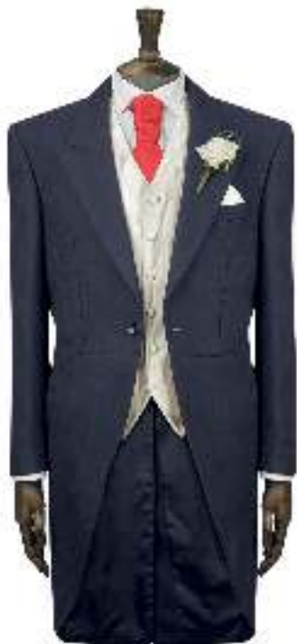
Navy Herringbone Tailcoat Available in sizes 20XS to 60R