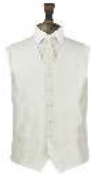
Plain Ivory with Ivory Stripe Tie